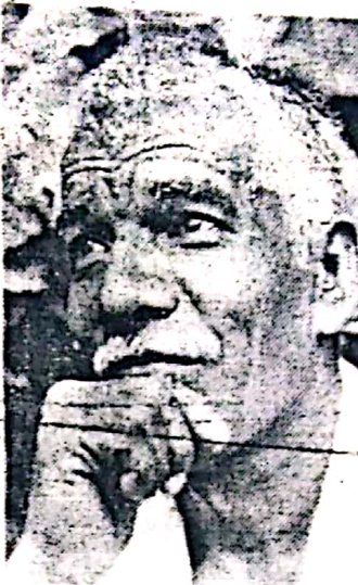
LOOKING AHEAD: Munivar

India, China and Japan will then emerge as powerful countries on whom 138 others will depend.